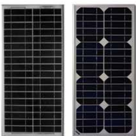
ESF- 20PA ESF- 20MA